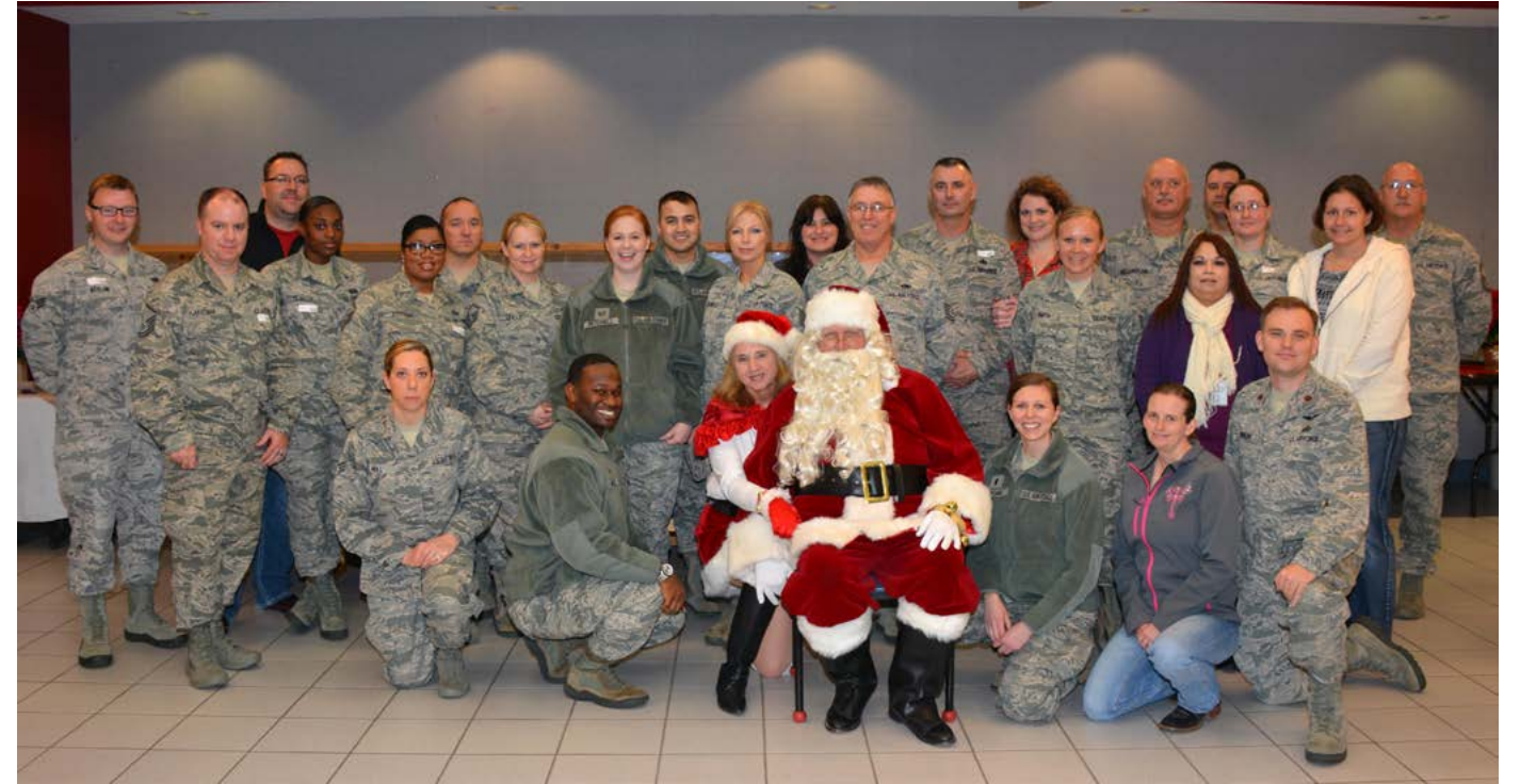
A group of Reserve and Guard Airmen pose for a photo before the Annual Norman Veterans Center Christmas Party Dec. 22.

Jokes from the veterans and the service members were flowing during the event. Military service rivalries and OSU/OU rivalries were alive and well during the visit. One Army Veteran and staunch Oklahoma University fan had to defend his OU comforter gift from a barrage of jokes from a