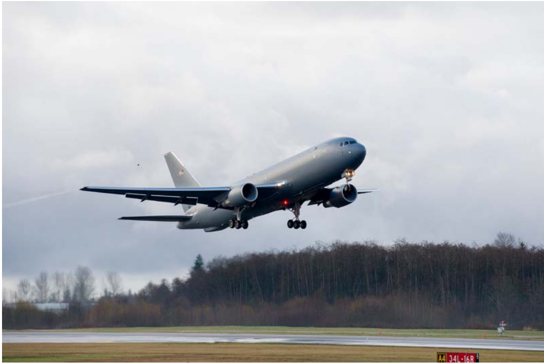
Boeing and the U.S. Air Force successfully completed the first flight of the KC-46 tanker test program today. The plane, a Boeing 767-2C, took off from Paine Field, Wash., at 9:29 a.m. (PST) and landed three hours and 32 minutes later at Boeing Field. The aircraft will receive its military systems following certification.